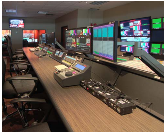
Astros broadcaster, Jim Deshaies, termed the new master control “the ultimate man cave.”

Diversified Systems provided the integration of the systems.